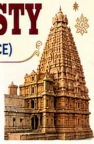
Brihadeeswarar Temple, Thanjavur (Built by Raja Raja I)