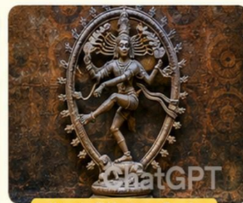
Nataraja, Chidambaram Temple